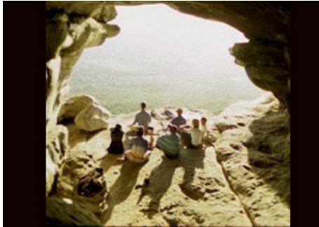
Cave of Ascension