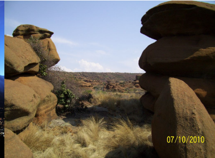
Portal with Rock Guardians